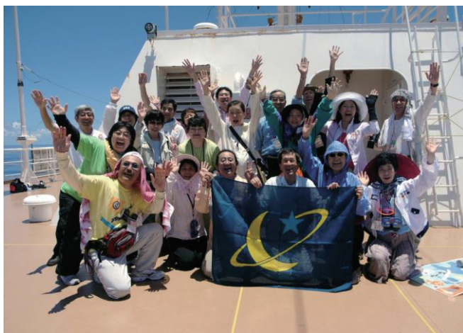
Fig. 10 and 11. Club's activity. Make a small telescope. Solar eclipse travel. The flag is club's symbol.

I'll display specific character of activity.