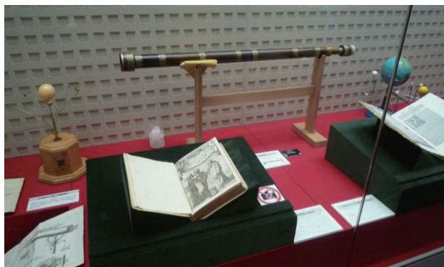
Fig. 5 Collections display, rare books, old telescopes, and solar system models