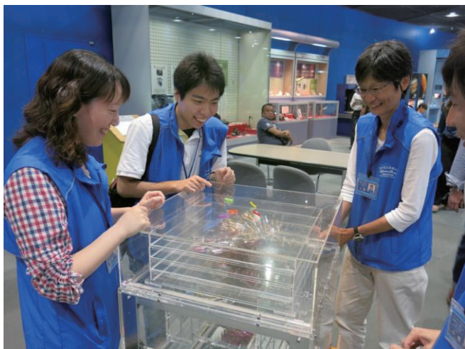
Fig. 12 Volunteer training at magnetism.

In many museum, travel exhibition uses to attract many visitors. On the other hand, may not be wanted their travel exhibition, attracting budget consuming and exhibits. Sometimes contents of the exhibition becomes a black box. Can't we do not deny the appeal of travel exhibition not to suffer. Or when want to held the travel exhibition, we will off the permanent exhibition has done or with the venue nearby.