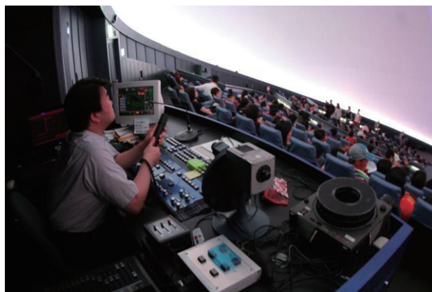
Fig. 6 Almost of planetarium are live show by scientist.

seats planetarium, and 3000 m 2 exhibition hall. A number of staff is 50 and educator/curator is only 11 included in.