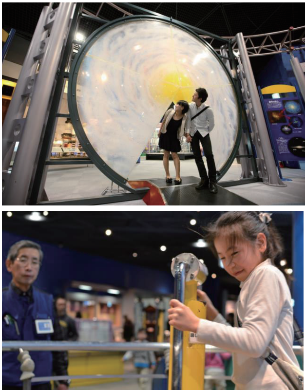
Fig. 3 and Fig. 4 Hands-On exhibitions at Osaka Science Museum. Almost of item are simple and easy to use.