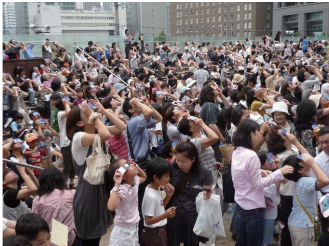
Fig. 9 Over 5000 citizens gathering our museum, and look solar eclipse.