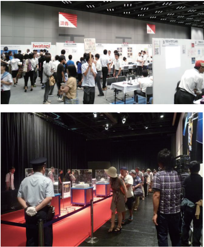
Fig. 7 and 8. large audience outreach with school teachers and commercial company, newspaper company. Special event at department store.