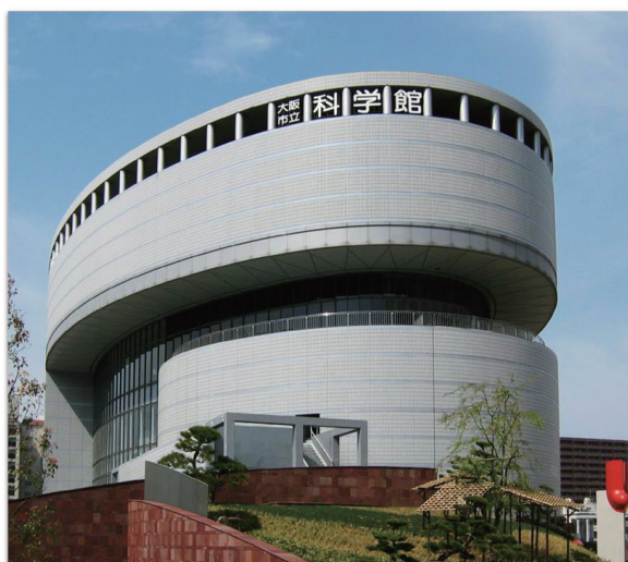
Fig. 1 Exterior of Osaka Science Museum

Osaka Science Museum is located in mega cities of Japan, has the large 318